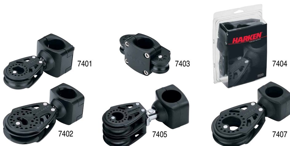
MKIV & MKIV OCEAN JIB REEFING & FURLING LEADS

Two stanchion leads forward guide line outboard to keep sidedecks clear. A stanchion lead aft features a double Harken Cam-Matic for cleating continuous furling line. A Carbo T2 block with shockcord attaches aft of the double cam to keep line in place for easy access.