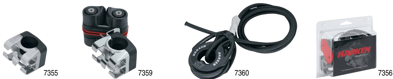
REFLEX ASYMMETRIC & CODE ZERO FURLING LEADS